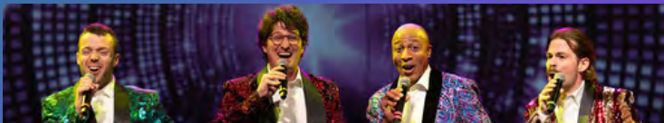
RETURNS OF FESTIVAL FAVORITES