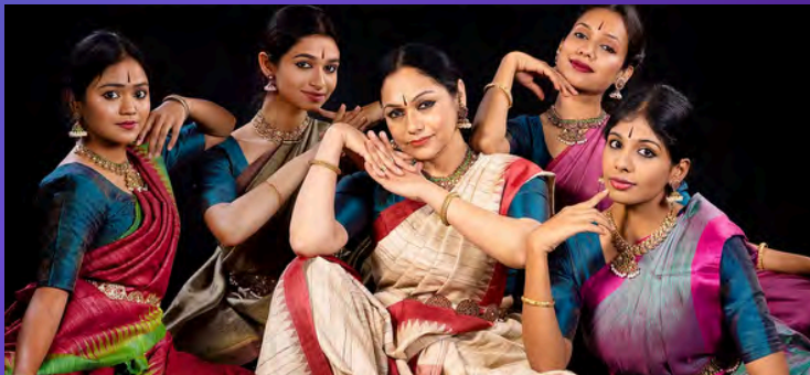
EXPLOSIVE NEW GENRES