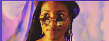
DEVELOPING LOCAL TALENT